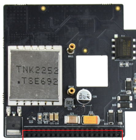
Connection Interface with DEBIX Model A/B/C/Infinity/R3576-01